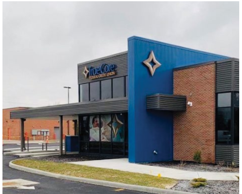
Pataskala building progress as of March 23, 2020.

According to extensive research, Pataskala provides a strong mix of existing TrueCore members as well as potential members. The results from TrueCore's most recent member survey also indicated that Pataskala was a top choice for an additional TrueCore branch.